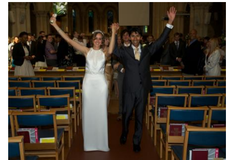
We did it!!