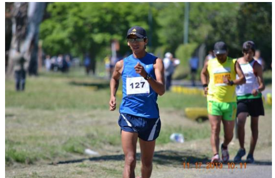
Marching towards the goal, “the upward call of God in Christ Jesus” Philippians 3.14