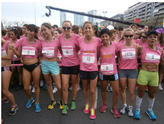
Loving Jesus and loving others in the world of athletics