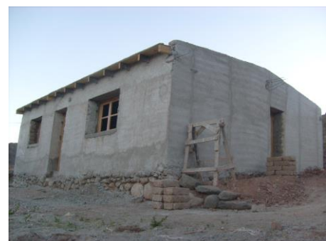
Our house in progress!