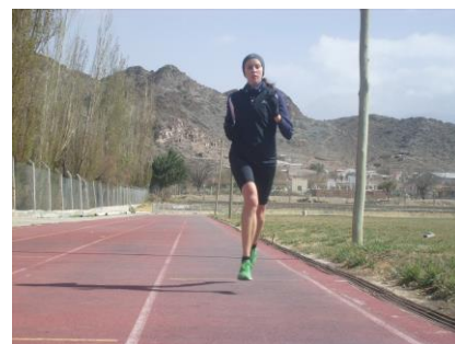
Training in the (cold!) Paradise of Cachi