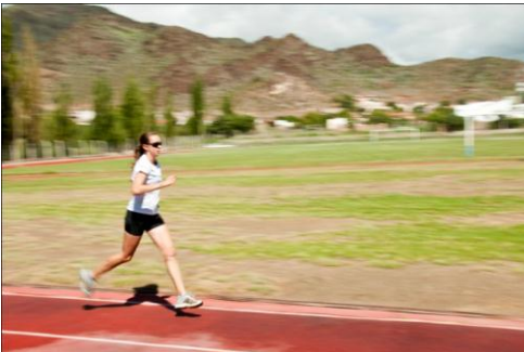
Cachi Jan 2012

Finally, a quick mention about biomechanics; can you spot the difference?